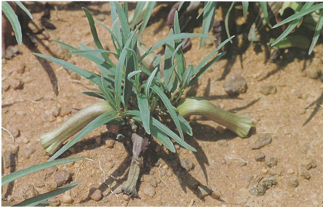
Brachystelma gymnopodum , previously known as Ceropegia pygmaea .