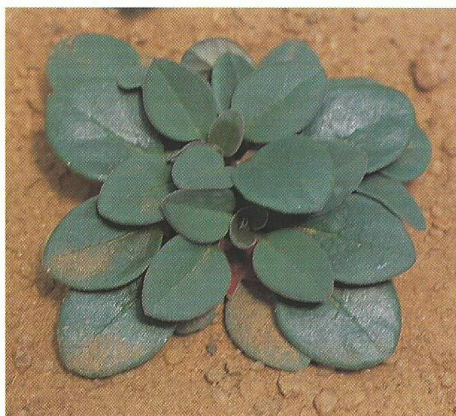
Brachystelma minor , at one year from seed, resembles a violet plant.

A well-drained acid mixture appears to give the best results; a mixture of Canadian peat, fine pine-bark chips, sand, vermiculite and perlite which has been sterilised beforehand at about 90°C