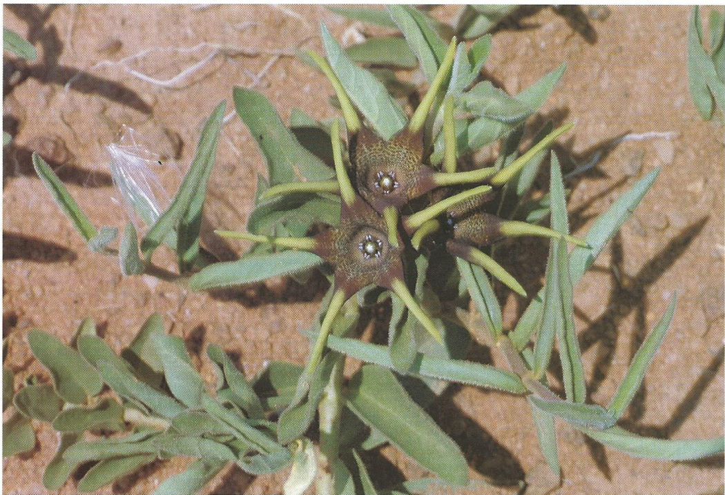
Brachystelma foetidum can have pretty yellow-green corolla lobes.