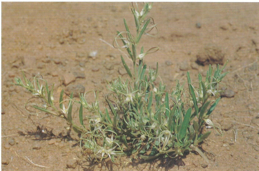
Brachystelma circinatum is a variable species and flowers can be small, 5 mm long, or larger, up to 25 mm, depending on where it grows.

The beetle which looks similar to the ladybird can only be controlled by diligent hand picking. The same can be said about the caterpillars of the monarch butterfly.